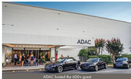
ADAC hosted the 600+ guest