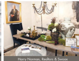
Harry Norman, Realtors & Swoox