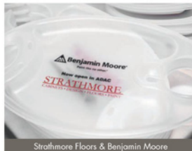
Strathmore Floors & Benjamin Moore