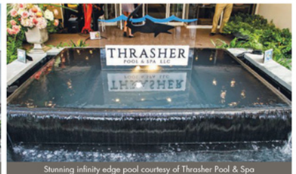
Stunning infinity edge pool courtesy of Thrasher Pool & Spa